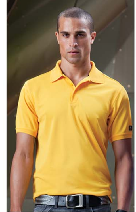
Little Darker Than 7540C