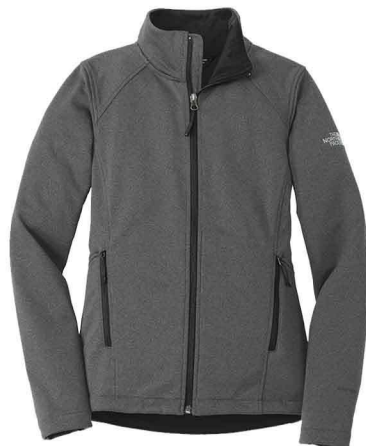
Cool Grey 11C & Cool Grey 8C

The North Face® products may not be resold without embellishment.