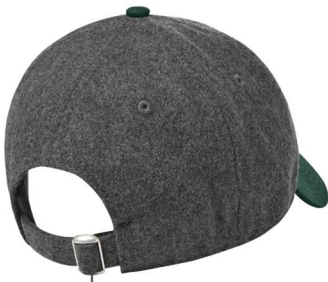
Adjustable D-clip closure