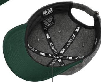
NEW ERA® taping on inside seams