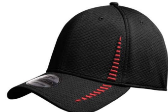
Neutral Black C / Between 200C & 201C