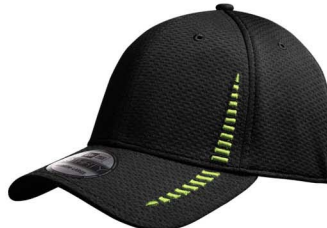
Neutral Black C / Between 374C & 375C