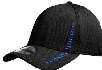
Neutral Black C / 2728C