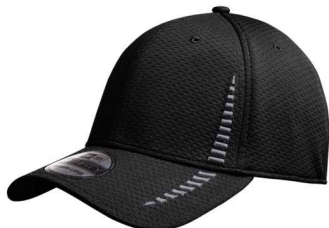
Neutral Black C / 431C