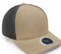
SAND/DARK GREY 7529C/Cool Grey 11C