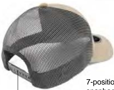
7-position adjustable snapback closure