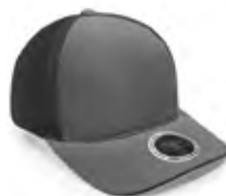
GREY/BLACK Cool Grey 11C/Black 6C