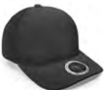
BLACK/BLACK Black 6C/Black 6C

Textile fabric colours are subject to dye lot variation and will not be exact match to print pantone reference