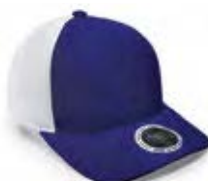
ROYAL/WHITE 2738C/No PMS