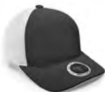
BLACK/WHITE Black 6C/No PMS