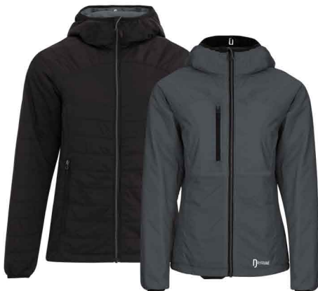
432C / BLACK 6C