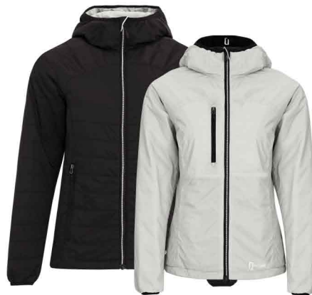
428C / BLACK 6C