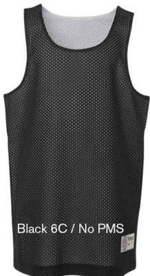
Black 6C / No PMS