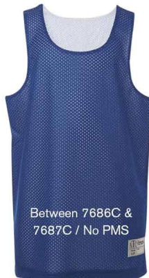
Between 7686C & 7687C / No PMS