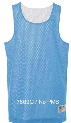
7682C / No PMS

Due to the nature of polyester, special care must be taken throughout the decoration process.