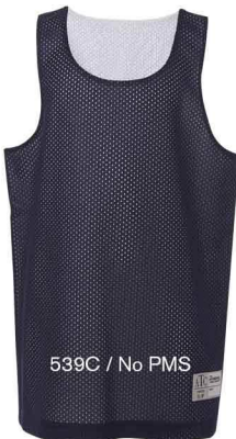
539C / No PMS