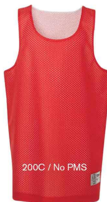
200C / No PMS