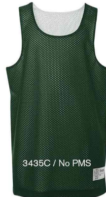
3435C / No PMS