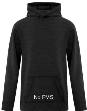
TRUE ROYAL DYNAMIC